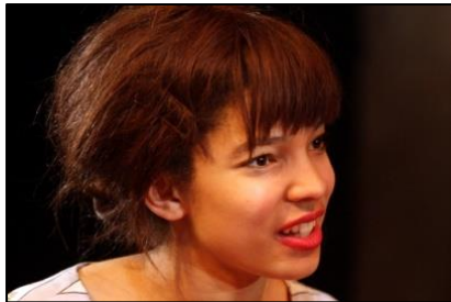
The Watermill Youth Theatre

The aim of Horizons is to give young people at risk an opportunity to explore a potential career in theatre, through work placements and workshops at The Watermill.