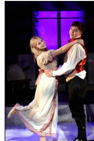
Youth Theatre Production

Where possible we arrange for a pair of tickets for the person on Horizons placement to experience live theatre.