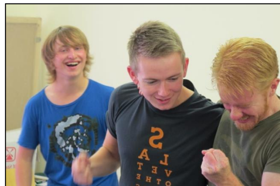
The Academy – an intensive course for people considering an acting career